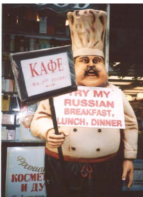
A local Russian restaurant advertisement in Brighton Beach, Brooklyn.